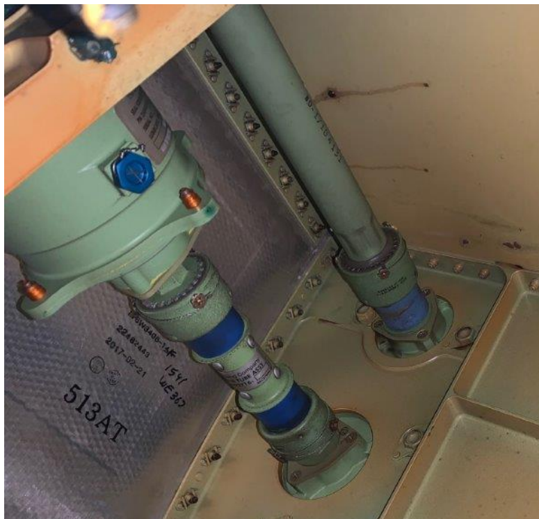
Left Wing Krueger Flap Motor