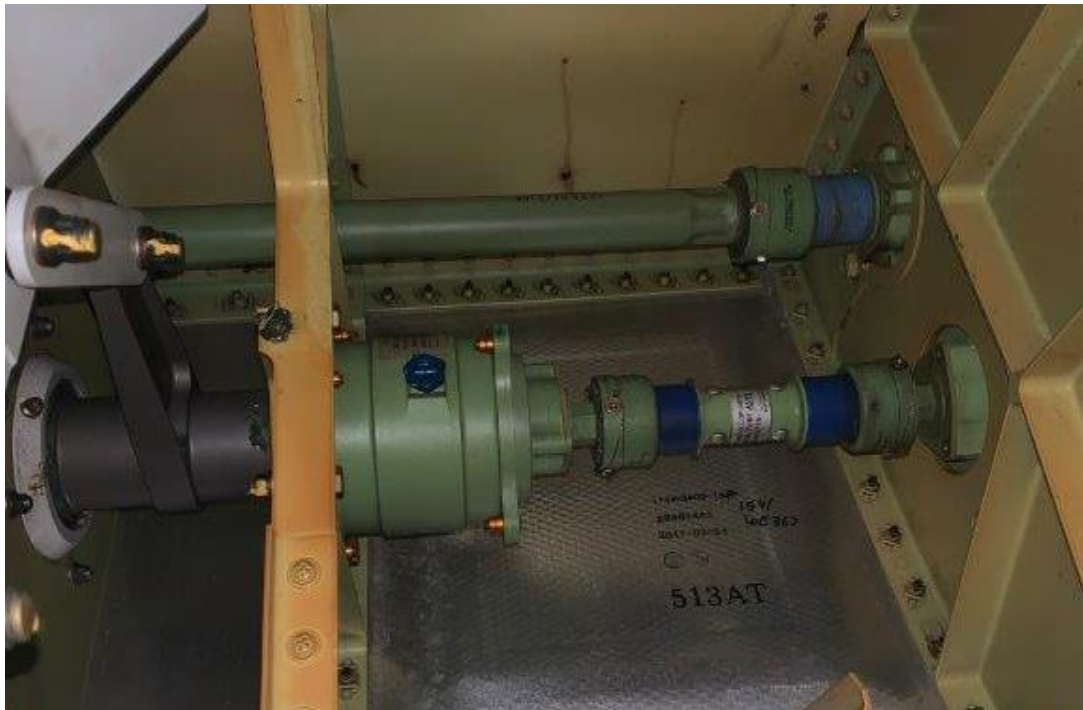
Left Wing Krueger Flap Motor